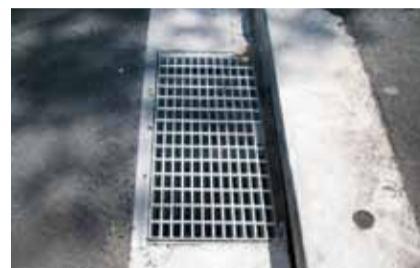
GALVANISED KERB GRATE