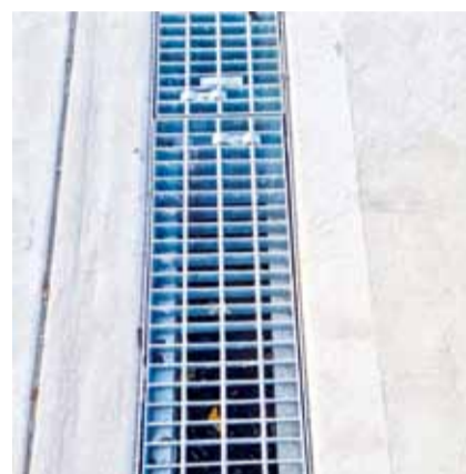
GALVANISED TRENCH GRATE