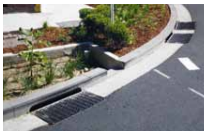
DUCTILE KERB GRATES