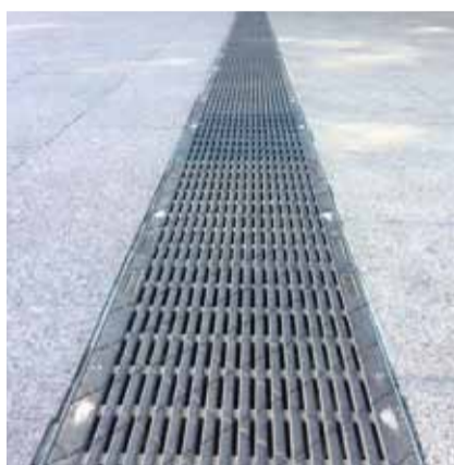
DUCTILE PEDESTRIAN GRATES