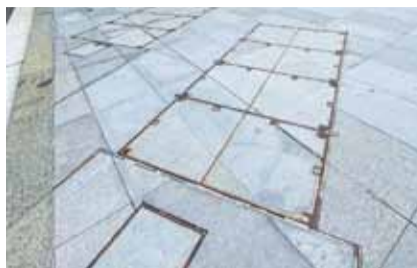
PAVER INFILL COVERS