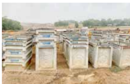
WET CAST PITS