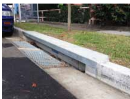
KERB ENTRY UNITS