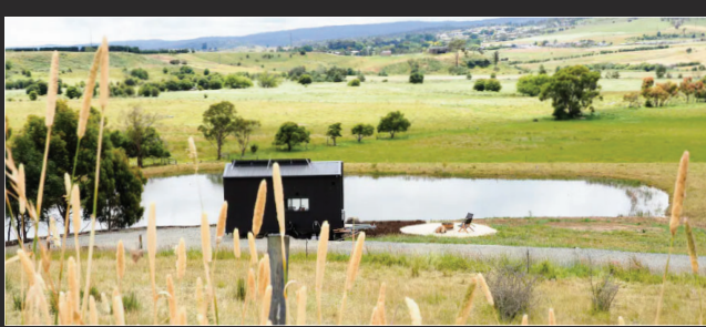
Please note: Some pictures may contain upgrades that are not included in standard configuration